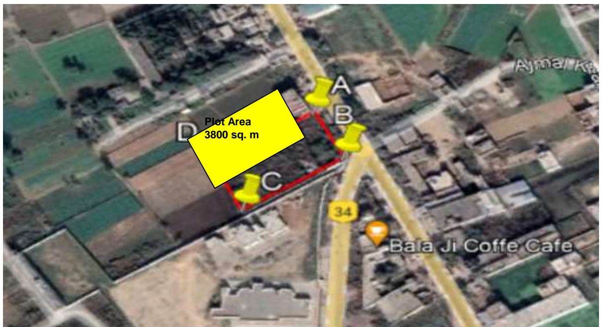
Location of Subject Site

The site is surrounded with Agricultural land along with residential cum commercial establishments. The site is situated on National Highway 34 (Haridwar -Najibabad Road).The access towards the subject site is through National Highway 34.