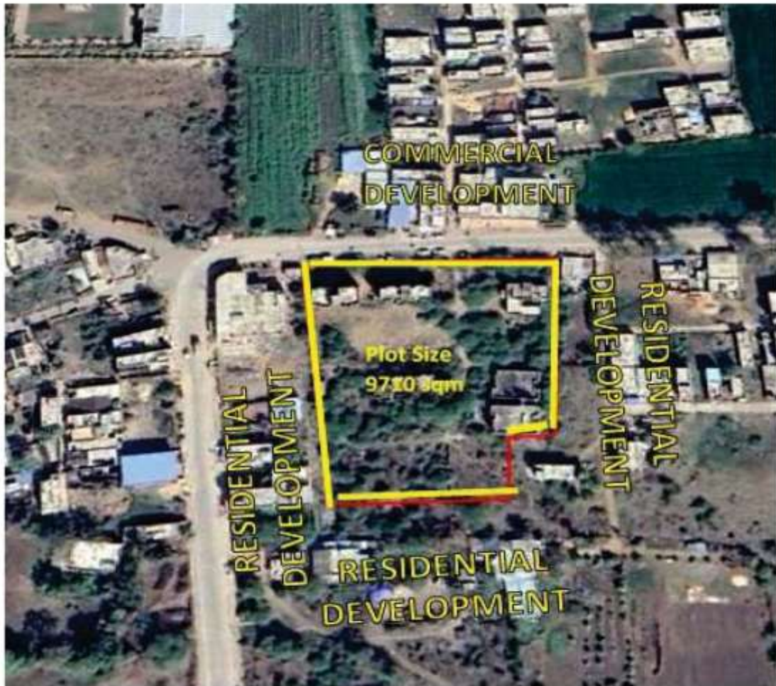
Location of Subject Site