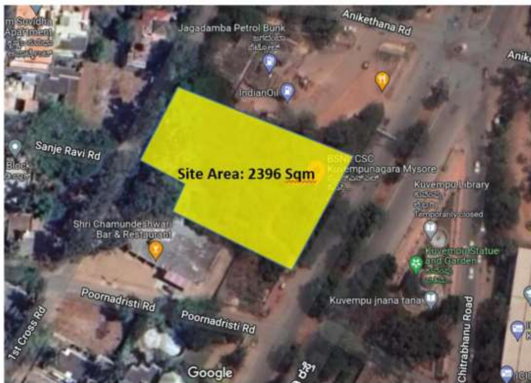
Location of Subject Site

The subject site is situated at 12°17'35.0"N 76°37'28.1"E in Kuvempunagar, Mysore. The site can be accessed by 4 roads on each side. It is surrounded by residential accommodations and commercial establishments like petrol pump, banks & retail stores etc. The site is at a distance of approx. 7.5 km from NH 275K, 5.8 Km from Mysore Bus Stand, 4.3 Km from Mysore railway station and approx. 12.4 Km from Mysore Airport.