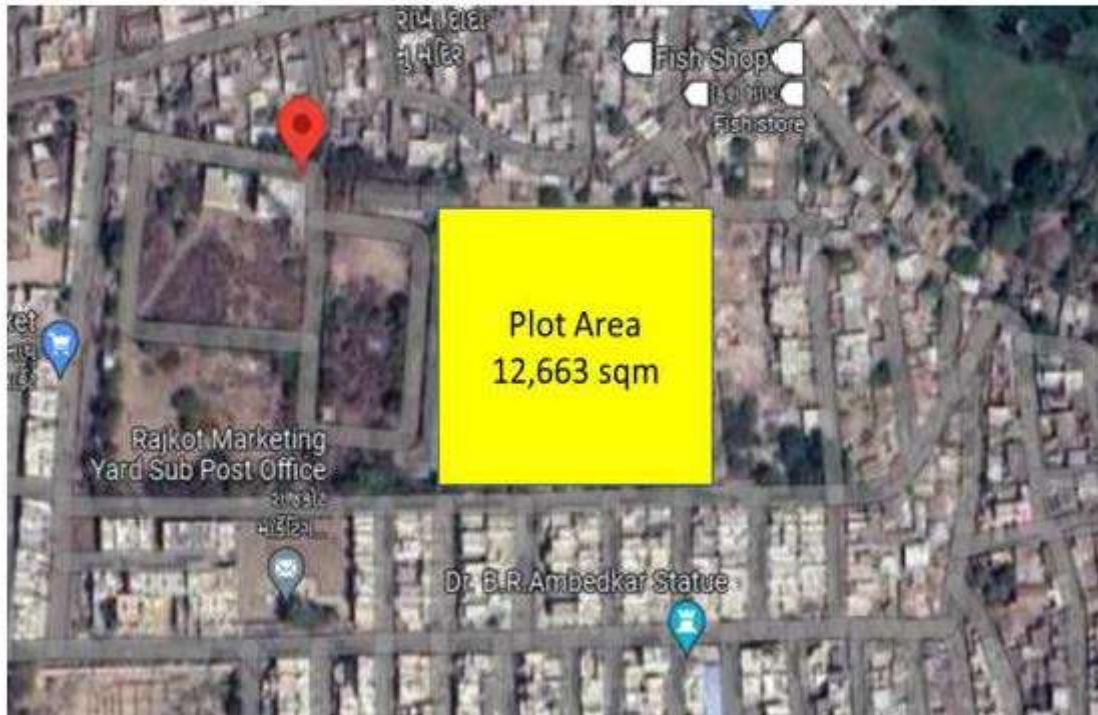
Location of Subject Site

The subject site is situated at 22°18'24.5"N 70°50'05.2"E near Narsingh Nagar Society. The site is adjacent to BSNL Telephone Exchange, Marketing Yard. The site can be accessed by a single road. It is surrounded by residential area. The subject site is at a distance of 1.5 Km from NH-27, 5.2 Km from ST Bus Stand, 4.8 km from Rajkot railway Station and 6.7 km from Rajkot Airport