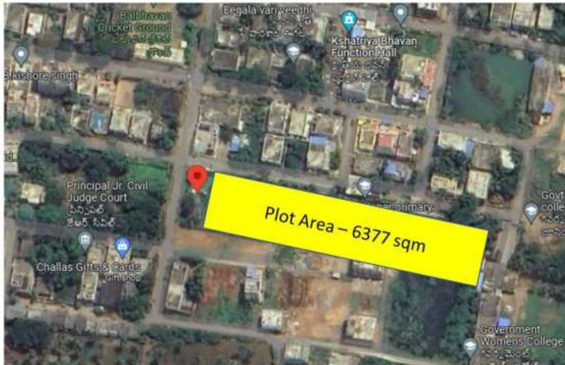
Location of Subject Site

The subject site is situated at 17°21'02.1"N 82°32'38.0"E in close proximity to educational institutions. The site can be accessed by 2 roads. The subject site is located and surrounded by residential colonies. Government Women's College and Upper primary school are near the subject site. A judicial Court is proposed to be developed opposite the site. The subject site is at a distance of approx. 3 Km from NH 16, approx. 4 Km from Tuni RTC Bus Complex, approx. 2.5 km from railway station and approximately 100 Kms from Rajahmundry Airport.